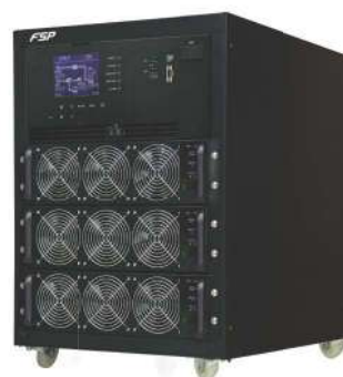
15 U 90kW

MPLUS 30U/42U extremely flexible characteristic, One power module with 30KW unity power factor can be single or multi module operation. In 42U cabinet model can up to 10 modules 300kW, elastic design offers proper backup power protection with appropriate capital investment whenever needed.